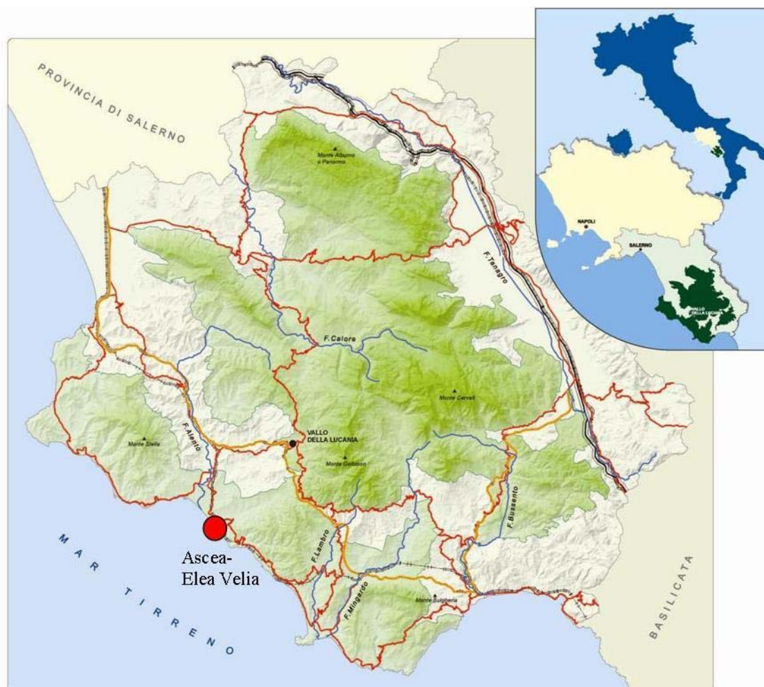
Figure 2: Location of Cilento, Vallo Diano and Alburni National Park-Geopark and Ascea-Velia-Elea

The 12th European Geoparks Conference will be held in Ascea-Velia-Elea, village located along the coast of the Cilento, Vallo Diano and Alburni National Park-Geopark, of the Campania Region in the southern Italy (fig.2).